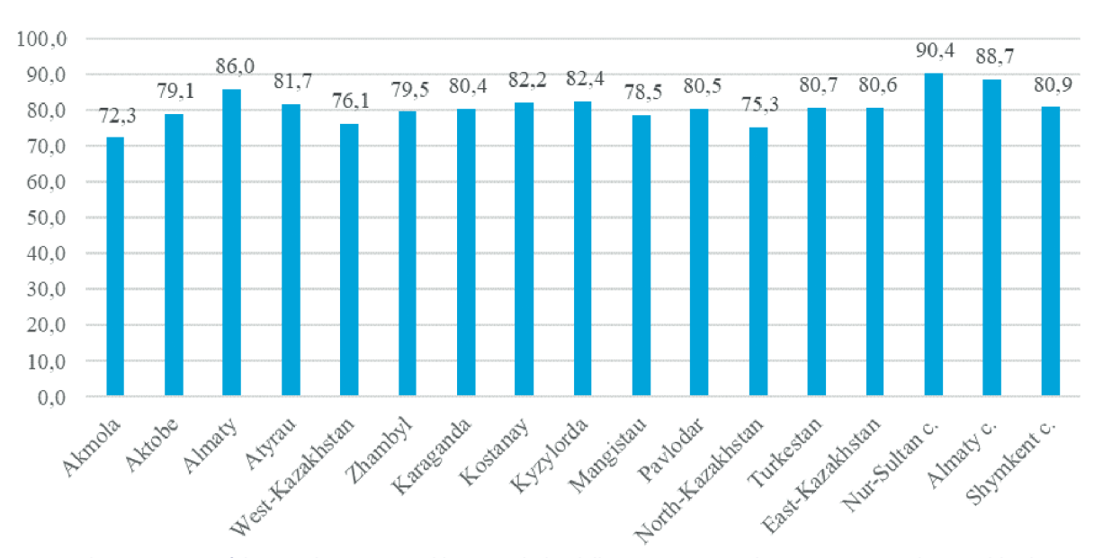
Fig. 2. The percentage of the population in Kazakhstan with the skills to use a personal computer, smartphone, tablet, laptop in 2020

level of economic growth in these regions and the insufficient level of development of ICT infrastructure. The indicators of Zhambyl and North-Kazakhstan regions are especially low, where the cost of ICT production amounted to 2.3 billion KZT and 3.2 billion KZT, respectively.